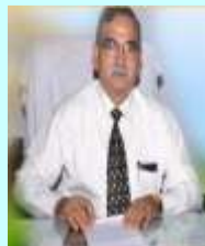
Director- Raj Kumar Goel Institute of Technology